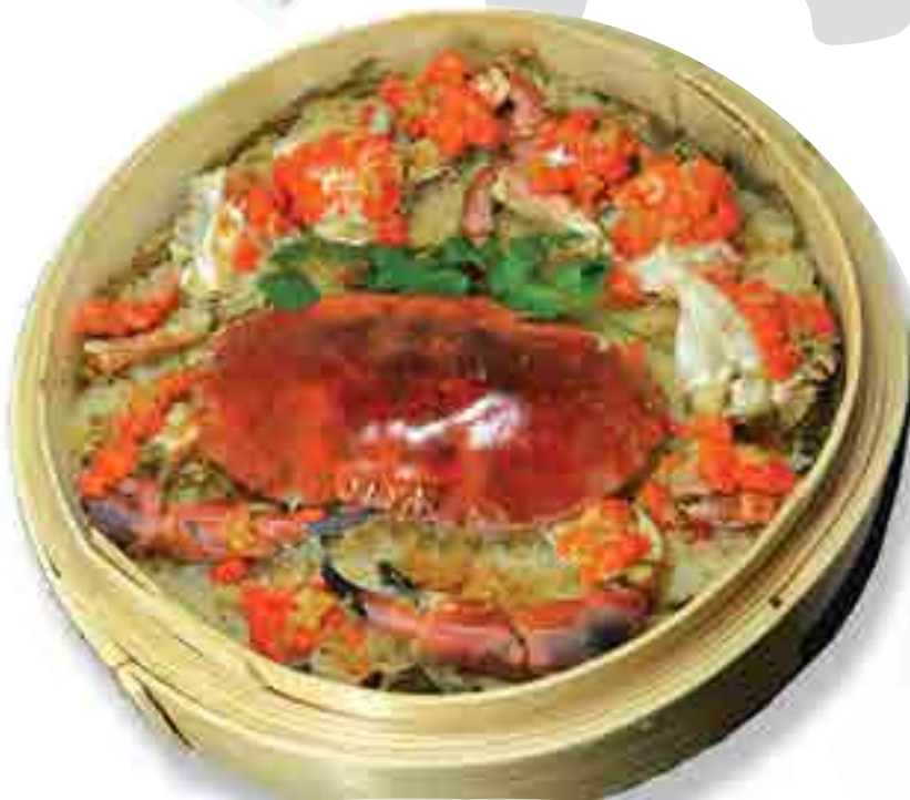
原籠糯米蒸蟹 £22.80 Steamed crab with garlic and glutinous rice in bamboo steamer

海寶一品煲 Ocean Treasure seafood special clay pot.....£28.80