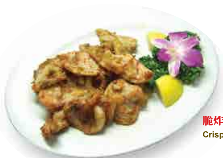
脆炸香茅豬扒 £16.50 Crispy fried pork chops marinated with lemon grass

Village style baked minced prawn and pork stuffed beancurd ..... £17.50