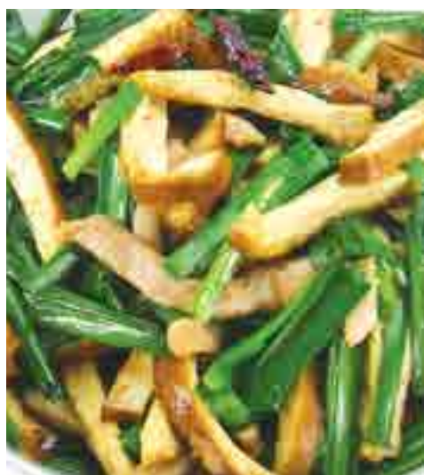
青韭肉絲豆乾 £16.00 Stir fried shredded pork with sliced dried tofu and chives