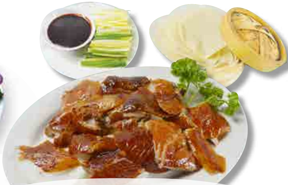
片皮鴨 每只 Whole £38.00 半只 Half £24.00 Sliced glazed roast duck served with spring onion, hoi-sin sauce & pancakes (另外椒鹽鴨架 每只 Whole £12.00 半只 Half £8.00)