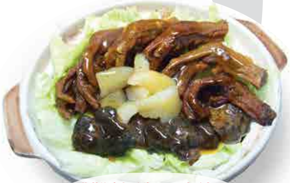
北菇海參扒鴨掌 £26.80 Braised sliced sea cucumber with duck feet and mushrooms 或 (鵝掌 另加 £3.00 Goose feet add extra £3.00)