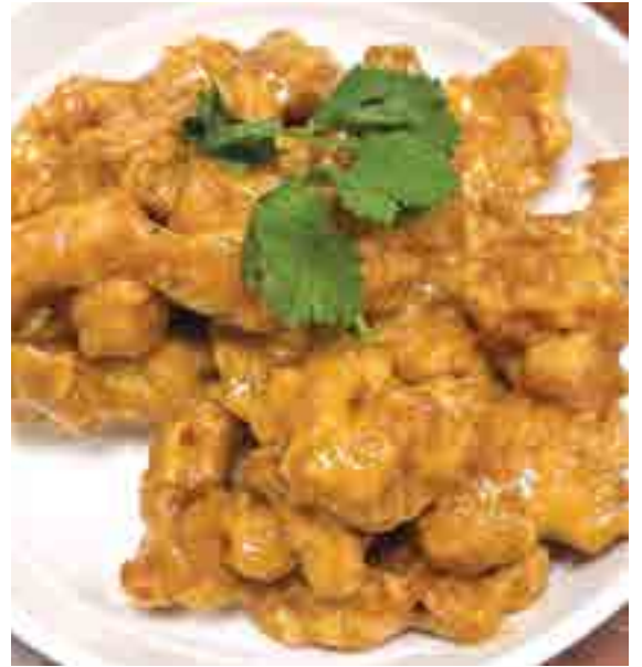
沙拉豬扒 £16.50 Pork chops with salad cream