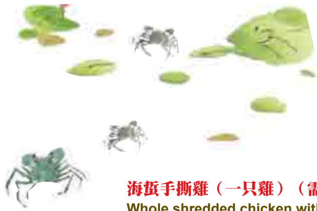
海蜇手撕雞 (一只雞) (需要預訂) £39.50 Whole shredded chicken with marinated jelly fish (pre-order only)