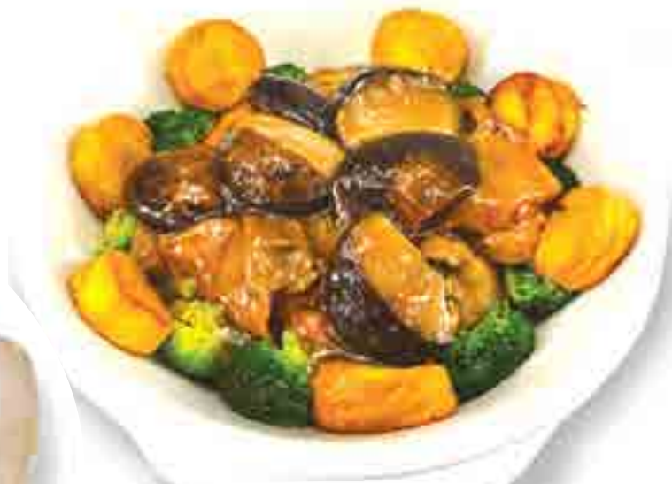
少林玉子素菜 (蛋豆腐) £18.00 Sliced egg beancurd and Chinese mushroom with vegetables