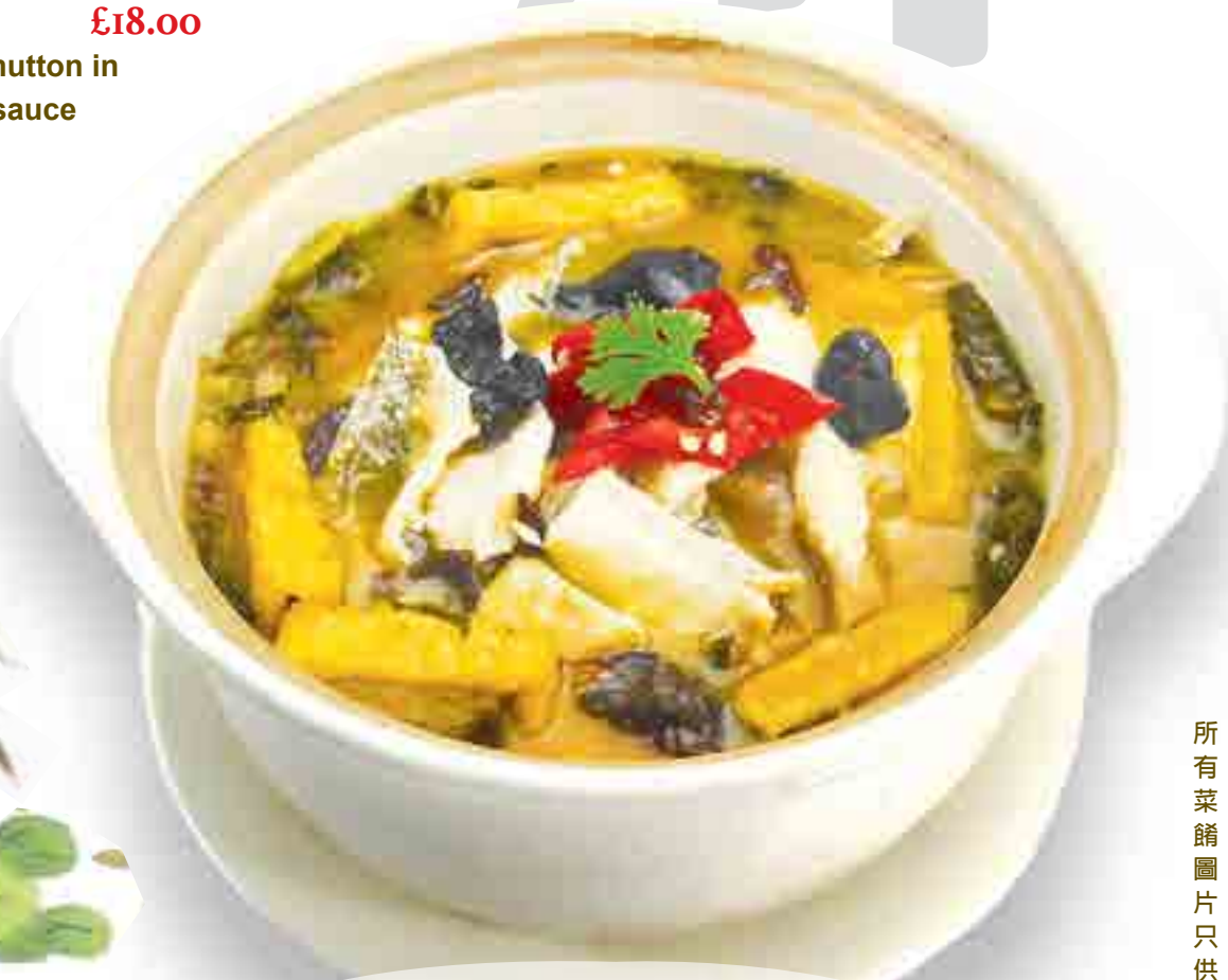
沙煲酸菜鱸魚 £32.80 Sea bass with preserved pickled vegetables casserole