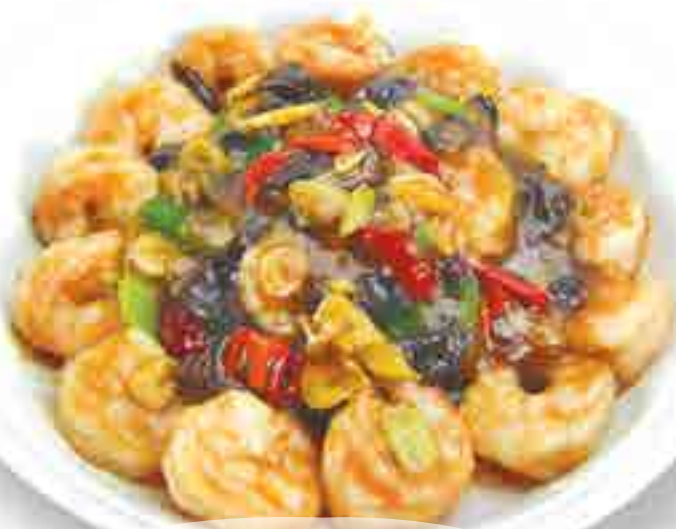
香辣蝦球 £18.50 Stir fried king prawns with chillies