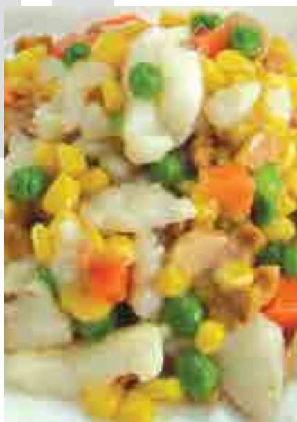
金粒魚米 £21.50 Stir fried diced fish and sweet corn