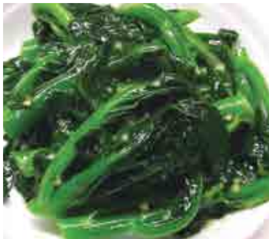
蒜蓉炒中國芥蘭 £18.50 Stir fried kai-lan with crushed garlic