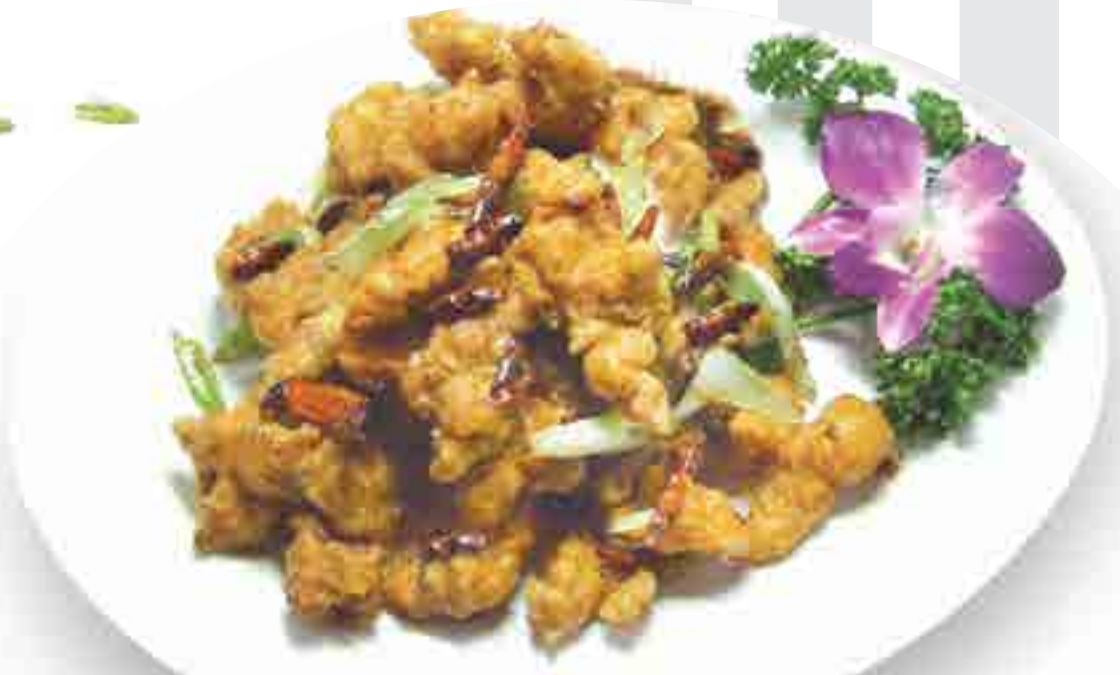
四川辣子雞 £16.80 Sichuan style spicy hot diced spring chicken

Beijing style dumplings (Pak choi and minced pork dumplings or minced pork and chives dumplings) (10 pieces).....£11.00