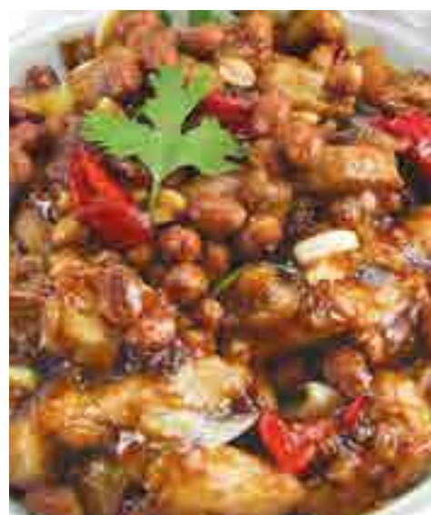
宮保雞丁 £16.50 Gongbao diced chicken with peanuts and dried chillies