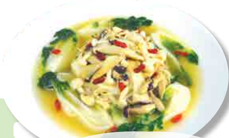
什菌上湯時蔬 (素) £17.50 Soaked assorted mushrooms with seasonal vegetables in high stock (V)