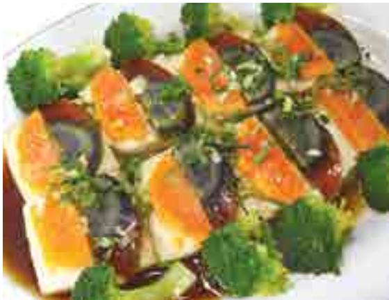
千歲豆腐 £15.50 Steamed tofu with sliced preserved duck eggs and sliced salted duck eggs