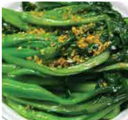
蒜蓉炒中國菜心 £18.50 Stir fried choi sum with crushed garlic