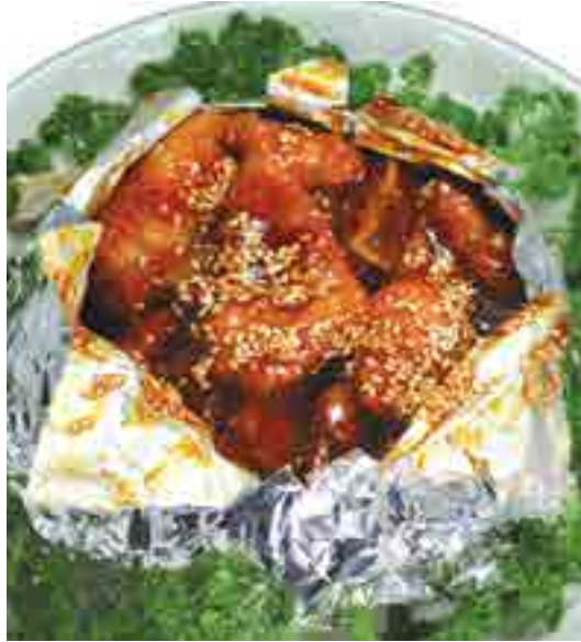
錫燒豬扒 £16.50 Pork chops with sesame seeds foil grilled