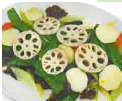
泮水芹香 (素) £14.50 Stir fried sliced lotus root with water chestnuts, mangetout, celery, carrot and black fungus (V)