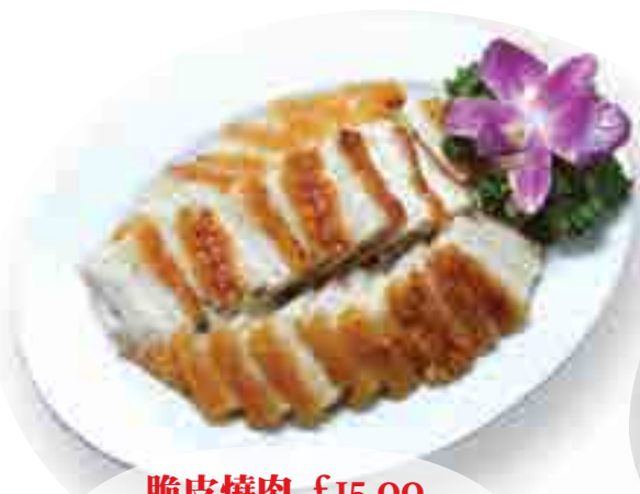
脆皮燒肉 £15.00 Roasted belly pork