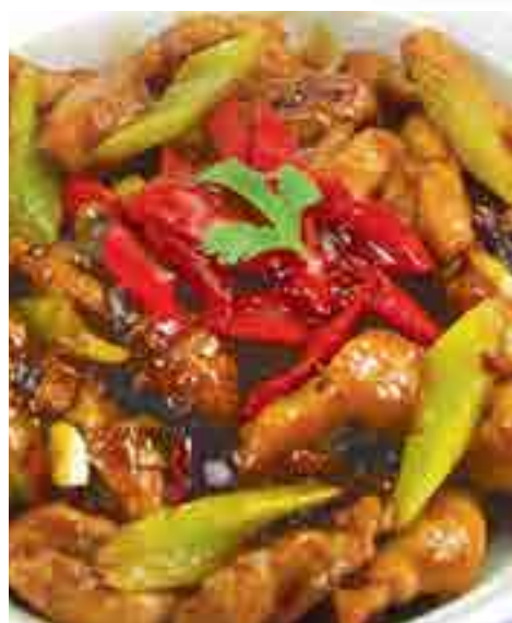
貴州香辣雞 £16.00 Guizhou style dry fried sliced chicken with chillies