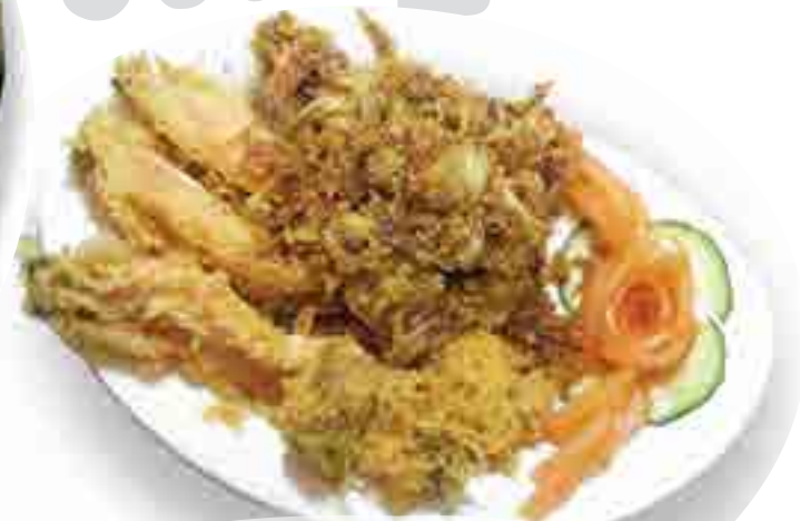
避風塘三寶 (軟殼蟹、大蝦及生蠔) £24.80 Harbour shelter style deep fried three treasures (Soft shell crab, king prawns and oysters)