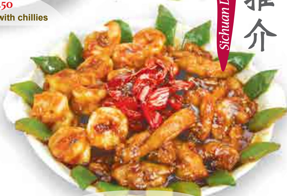
龍鳳相會 £19.00 Stir fried spiced king prawns and sliced chicken