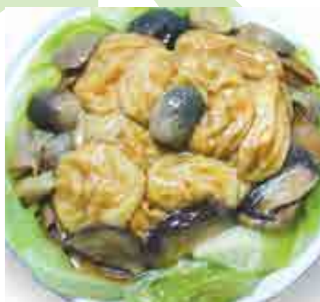
三菇扒豆腐 (素) £16.50 Braised beancurd with three types of mushrooms (V)