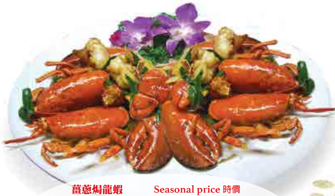
薑蔥焗龍蝦 Seasonal price 時價 Baked lobster with spring onion & ginger

鮮荔芋帶子盒 Scallops wrapped with crispy fried taro parcels .....£21.80