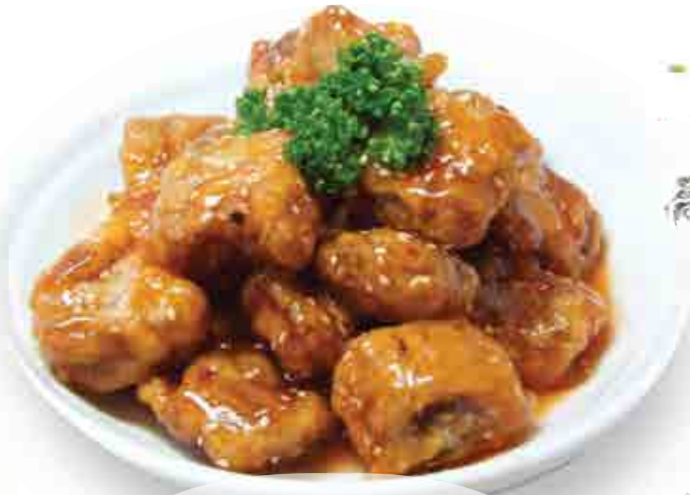
糖醋麻仁排骨 £16.80 Sweet vinegar spare ribs with sesame seeds