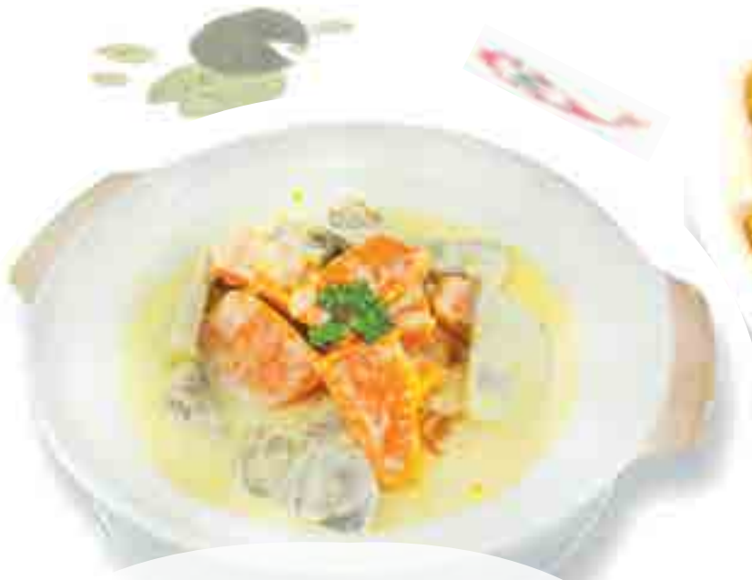
奶香南瓜香芋煲 £16.50 Braised sliced pumpkin, taro cook with milk and butter clay pot