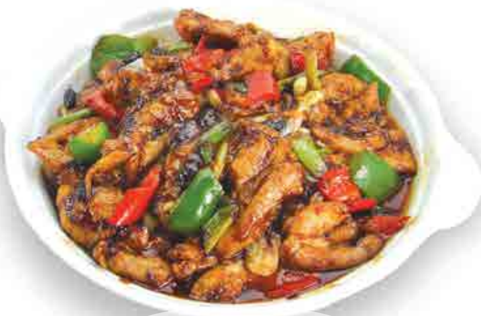
大千子雞 £16.00 Painter Daqian style stir fried sliced chicken with chillies