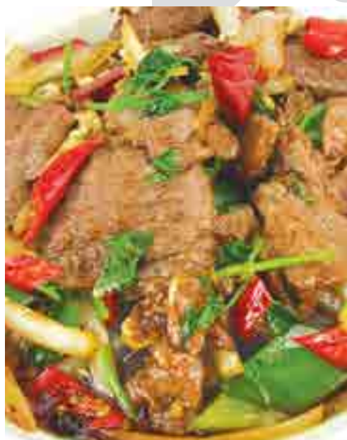
老乾媽炒羊肉 £18.00 Stir fried sliced mutton in Laoganma chilli sauce